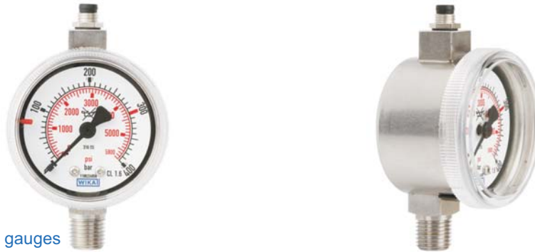
Reed contact pressure gauges