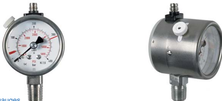
Reed contact pressure gauges