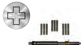
Enlargement XL to cover range ID 25-152 mm (0,984- 5,984 inch)