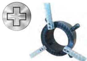
Special tool for beveling elbows