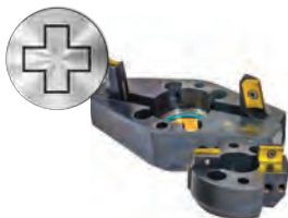
Tools for MF3i from page 48