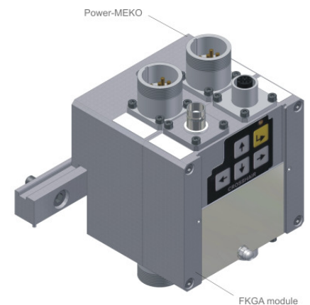
FKGA module with Power-MEKO