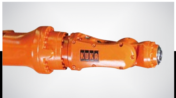
The streamlined design with low disruptive contours makes it possible to reach workpieces, even in confined spaces.