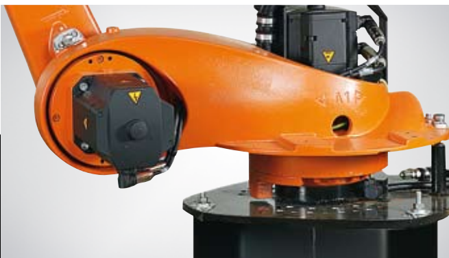
Having axis 2 located further forward offers high flexibility and outstanding accessibility, particularly when reaching downwards.

KUKA offers you a comprehensive range of software. In addition to expandable system software and simulation programs for system design, we also provide you with specific application software, such as KUKA.PlastTech: the software coordinates and optimizes the work process of robots and injection molding machines – thereby reducing the cycle time for production of the parts. The advantages: maximum ease of operation and major time savings.