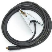
Earth return cable 5 m, 16 mm 2