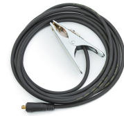
Earth return cable 10 m, 25 mm 2